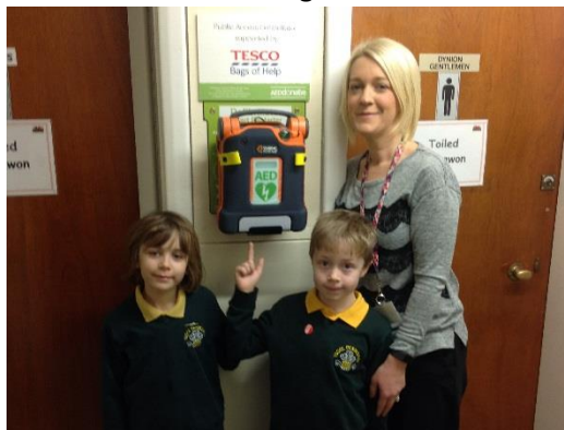
Nant BH February 2019