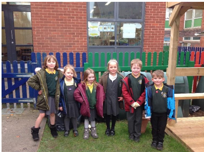
Foundation Phase school council tidying the outdoor classroom.