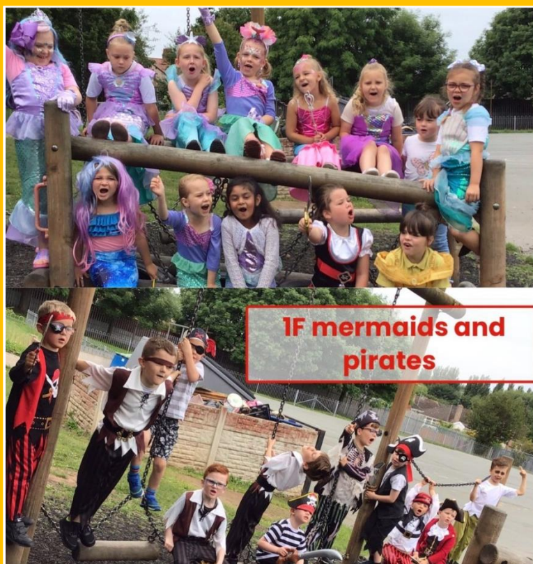
1F mermaids and pirates