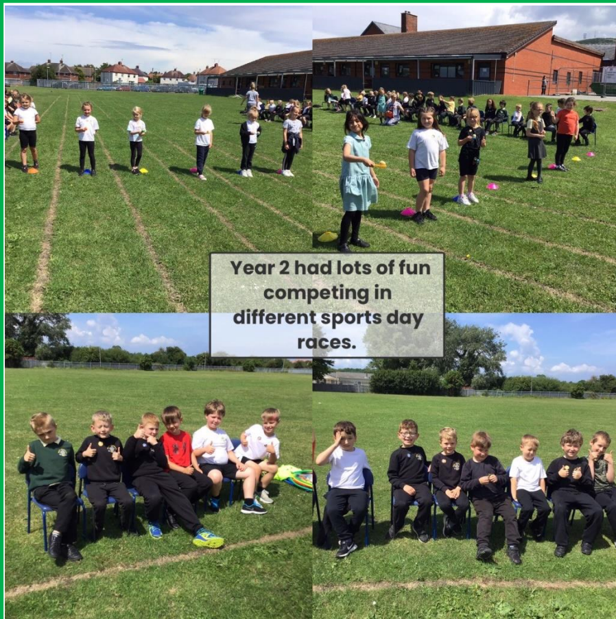
Year 2 had lots of fun competing in different sports day races.

End of year school reports have been emailed out today – please check your emails. Any problems please don't hesitate to contact me.