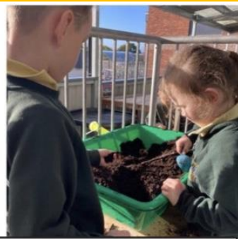
1F had great fun exploring outdoor challenges.