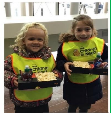
Children in Need

We have had another wonderful visitor in Blwyddyn 4 this week. The children loved learning about the amazing job that the Fire Service do and enjoyed trying on the protective gear! We have some aspiring firefighters in Blwyddyn 4 now!