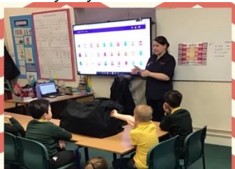
Fire service visit Blwyddyn 4