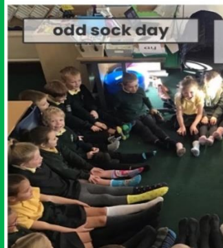
odd sock day