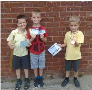
Da iawn chi!