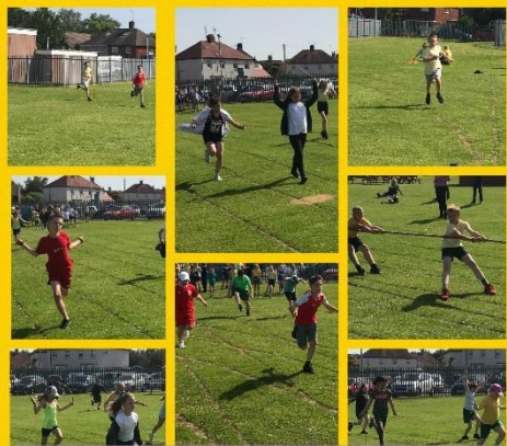
Year 5/6 Sports Day! Da iawn pawb!!