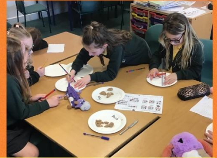
3J enjoyed their 'Hands on History' lesson, learning all about the Roman diet. They dissected samples of 'Rich' and 'Poor' Roman poo, to learn about what the different classes in society ate. A messy but memorable learning experience! 😊