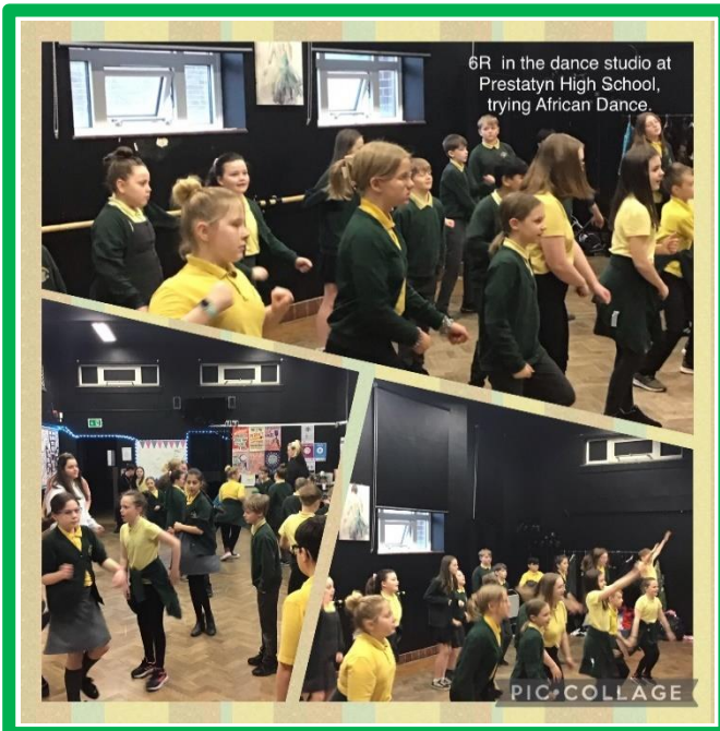
6R in the dance studio at Prestatyn High School, trying African Dance.