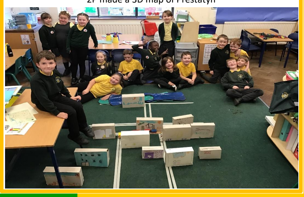
2P made a 3D map of Prestatyn