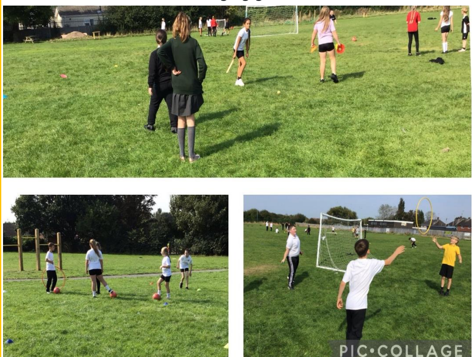
Making the Most of Everyone

6G have enjoyed working in groups to use different equipment to create and play their own games. They had some interesting and challenging games.