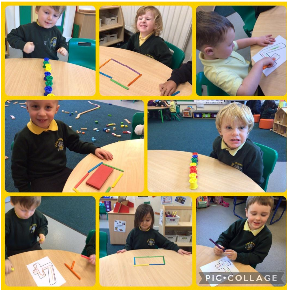
Making the Most of Everyone

Nursery W were very busy with their Maths last week. They made rectangles, rainbow writing number 4 and made straight lines with loose objects.